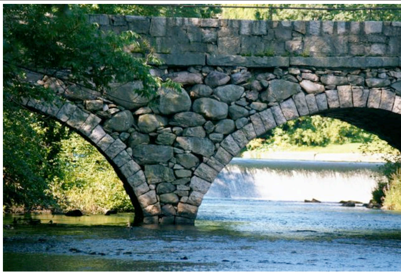
The Eliot Bridge, South Natick

The history books show that the river at this point was supposed to have been a dividing line